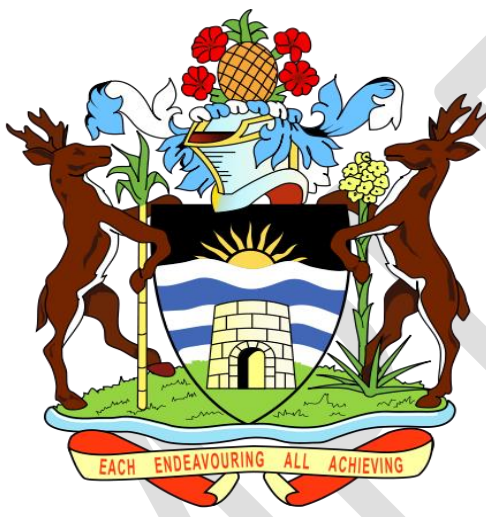
The Government of Antigua and Barbuda